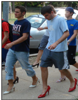
College students walking the mile.

There is an old saying: "You can't really understand another person's experience until you've walked a mile in their shoes." Walk a Mile in Her Shoes® asks men to literally walk one mile in women's high-heeled shoes. It's not easy walking in these shoes, but it's fun and it gets the community to talk about something that's really difficult to talk about: gender relations and sexual violence.