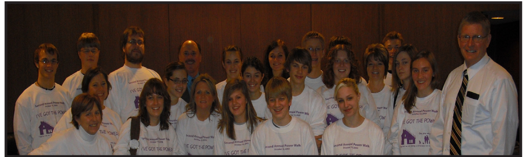
Minnewaska Area High School students and Someplace Safe staff go to Action Day at the Capitol.